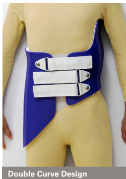
Double Curve Design