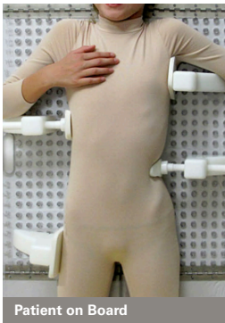
Patient on Board

Spinal Technology is pleased to offer our popular Providence® Scoliosis Course. Join us on Saturday, September 28, 2019 1pm to 5 pm at AOPA National Assembly in San Diego.