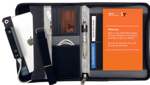
Ask about our 3D Scan Package

Attend our Providence® Course on Saturday 9/28!