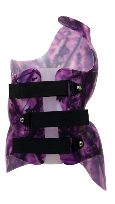
SCT 3D Chêneau (Style) Scoliosis Brace