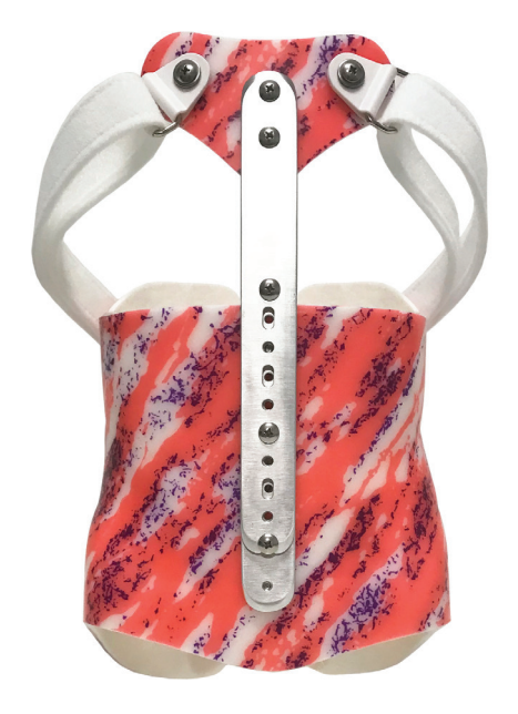
Low Profile with Custom Sternal Shield