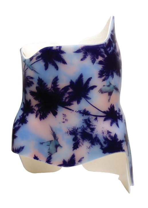
SCT 3D Full-Time Scoliosis Brace