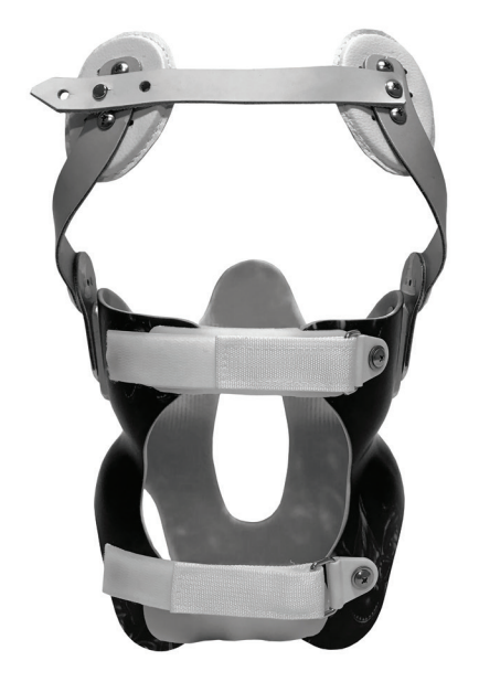
Kyphosis Brace with Anterior Opening & Cow Horns