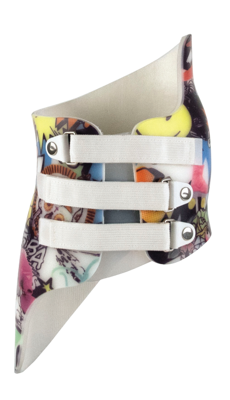
Providence Nocturnal Scoliosis® Brace