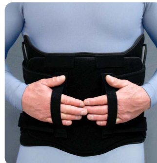
Hand Strap for Ease of Donning