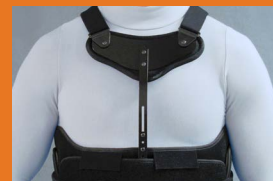
ATE / PTE with Shoulder Straps