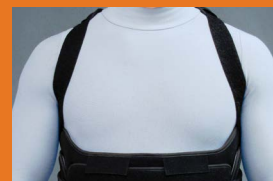
PTE with Axilla Straps