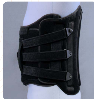
Adjustable Hook and Loop Straps