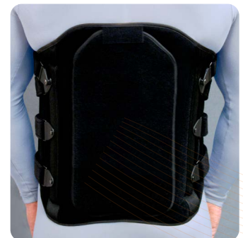
Rigid Posterior Panel