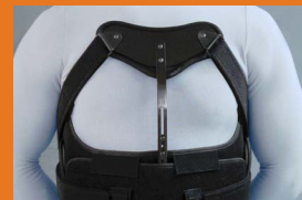
ATE with Axilla Straps