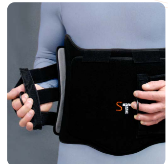
Adjustable Hook and Loop Closure